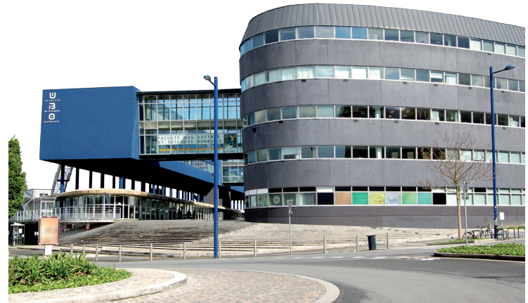
The School of Arts and Human Sciences, home to the CRBC