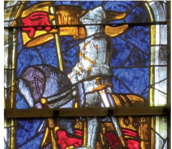
A stained glass from the church of Locronan

Students registering for this Masters have the choice of following one of two strands: “ Medieval Celtic Worlds ” or “ Modern Celtic Worlds ”. As the title implies, the first strand focusses on the study of the medieval Celtic languages (Old Irish, Middle Welsh, Middle Breton/Cornish) as well as their respective literatures and cultures. Medieval Latin is on offer as well. Old French texts (in the original language) relating to the Arthurian Cycle and the Matter of Britain more generally are taught by CRBC specialists.