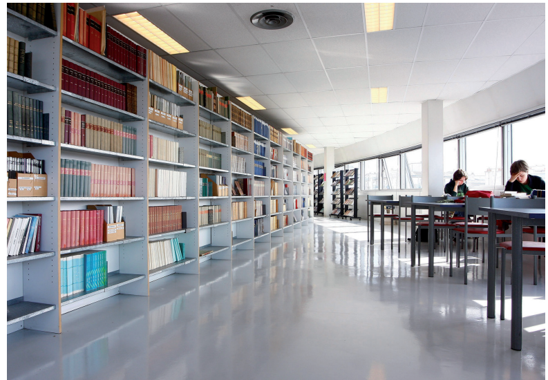
The CRBC library